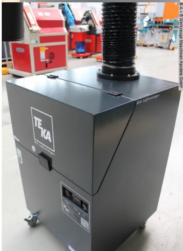
© A + B Werkzeuge Maschinen Handels GmbH