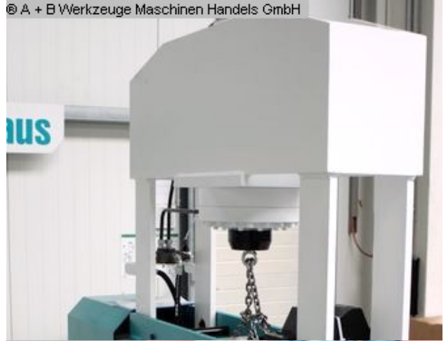
© A - B Werkzeuge Maschinen Handels GmbH