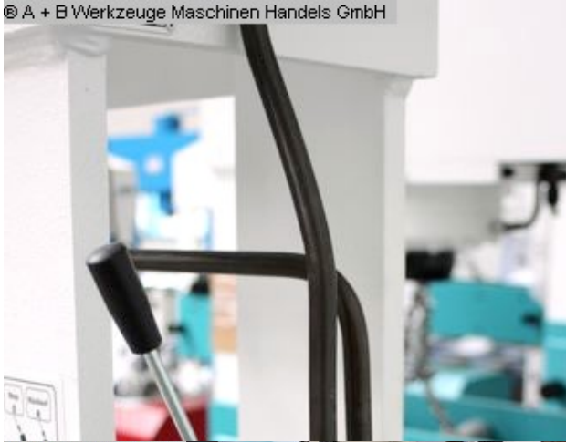
© A - B Werkzeuge Maschinen Handels GmbH