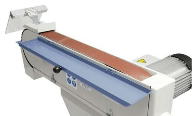
® A + B Werkzeuge Maschinen Handels GmbH